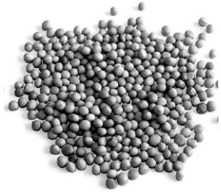
“White Mustard Seeds”, Edal Lefterov (2012)

30 He also said, “With what can we compare the kingdom of God, or what parable will we use for it? 31 It is like a mustard seed, which, when sown upon the ground, is the smallest of all the seeds on earth; 32 yet when it is sown it grows up and becomes the greatest of all shrubs, and puts forth large branches, so that the birds of the air can make nests in its shade.”