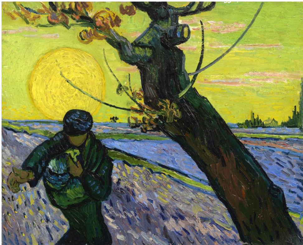
'The Sower', Vincent van Gogh (1888)