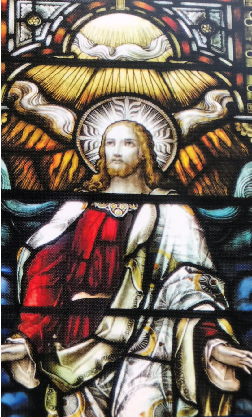
Ascension Window, Mayfield Salisbury, South Transept