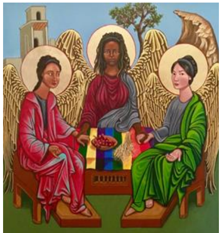
‘Trinity’, Kelly Latimore (2016)