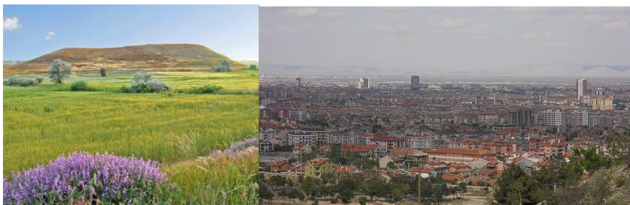
Site of Lystra, Galatia

19 But Jews came there from Antioch and Iconium and won over the crowds. Then they stoned Paul and dragged him out of the city, supposing that he was dead. 20 But when the disciples surrounded him, he got up and went into the city. The next day he went on with Barnabas to Derbe.