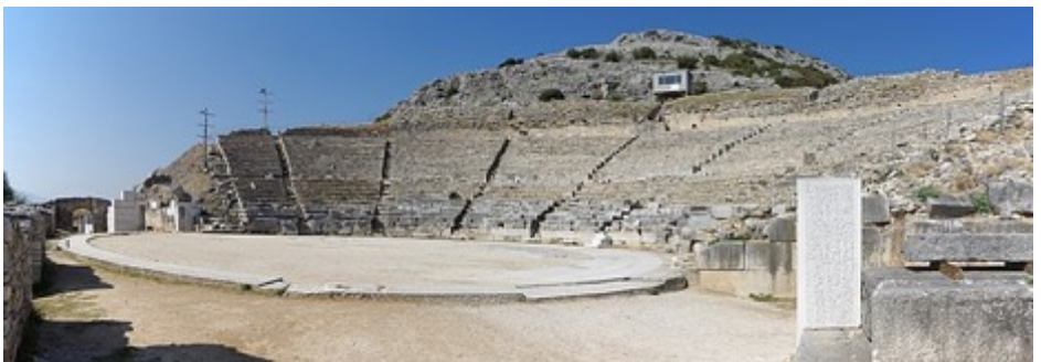
Philippi, East Macedonia (modern Greece)