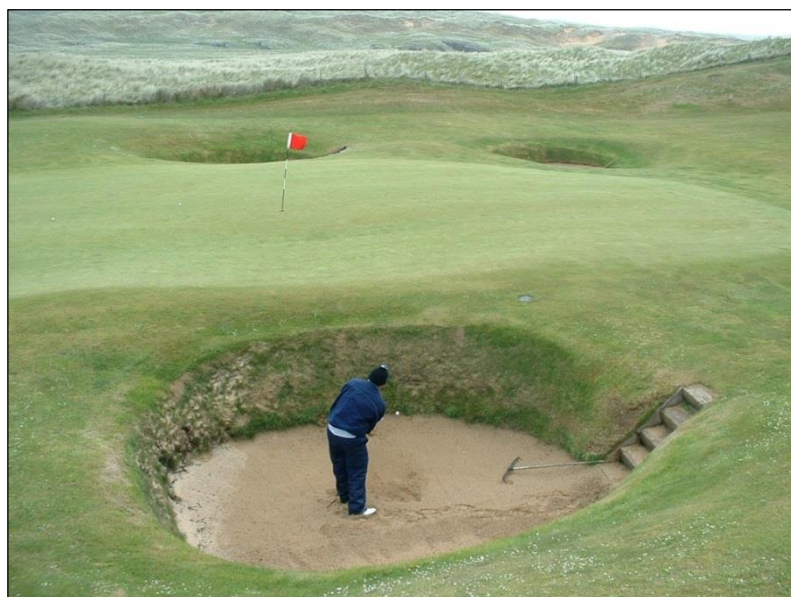
Figure 13 Ballyliffin, Co. Donegal 2003 Les Sibbald attempts an escape from a cavernous bunker

At that time of our first “foreign” tours membership of WMGC remained around 13 -15 members with an average attendance at each of the now six