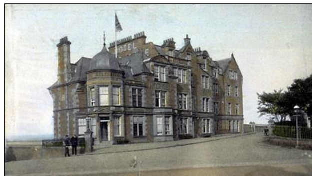
Figure 10 Roxburghe Marine Hotel, Dunbar

In 1910 the usual single round at Hedderwick was debated against a full day's golf with the members playing Hedderwick in the morning, lunching at the Roxburghe Marine Hotel, (Dunbar), and playing a Captains v Vice Captains match in the afternoon. After a vote the usual arrangements stood.