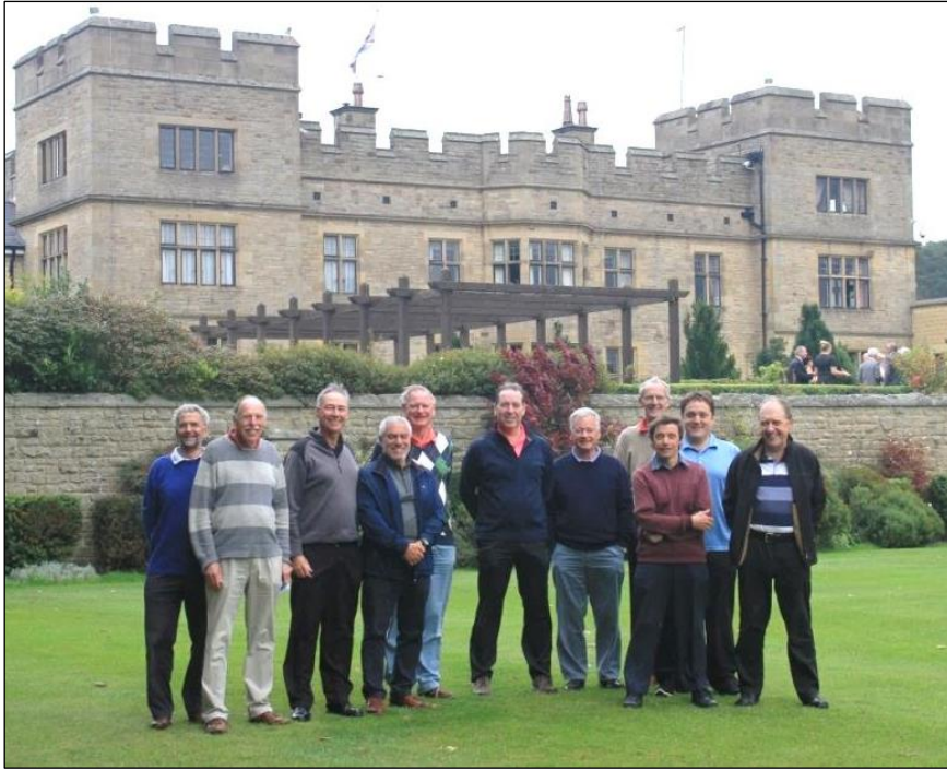
Figure 18 Slaley Hall autumn tour 2017