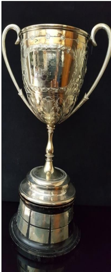
Figure 2 Sime Cup

West Mayfield Golf Club is a non-course owning club. The Club therefore seeks out suitable venues for its outings usually within an hour or so from its Edinburgh home. West Mayfield Golf Club has a long history. The Club was established by members of Mayfield Free Church, which is situated on the corner of West Mayfield and Mayfield Road on the south side of Edinburgh - hence its name.