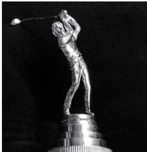
Figure 6 Spring Tour Trophy

There are in addition spring and autumn trophies donated by John Lunn and Ian Beckett respectively.