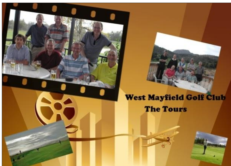
Figure 16 WMGC Tour DVD

WMGC are not unaware of the changes affecting golf in the 21 st century both nationally and internationally. In particular the members are acutely aware of the increasing age of club membership, and steps have been taken to introduce younger members and indeed we now have a father and son pairing which is most welcome. Membership fees are currently £10 per annum – surely great value today!