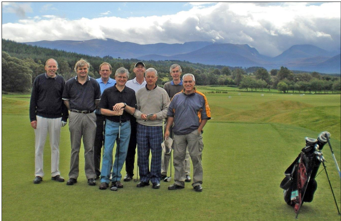
Figure 19 Spey Valley September 2010