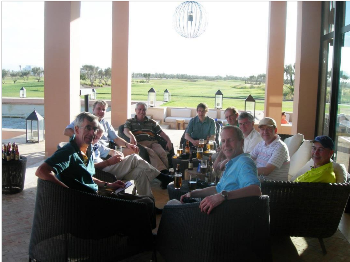
Figure 15 Tourers relaxing after a round at Royal Marrakech