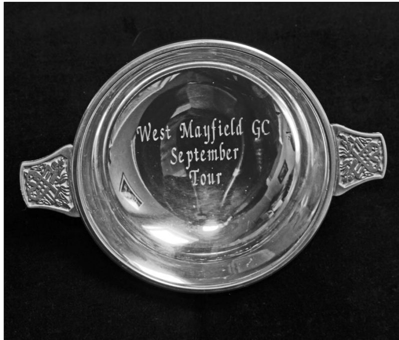
Figure 7 Autumn Tour Trophy

These are played for on tour, where the scoring is Stableford on the day but adjusted to a points total with handicap adjustments after each day's play. (See Appendix 5 for an example).