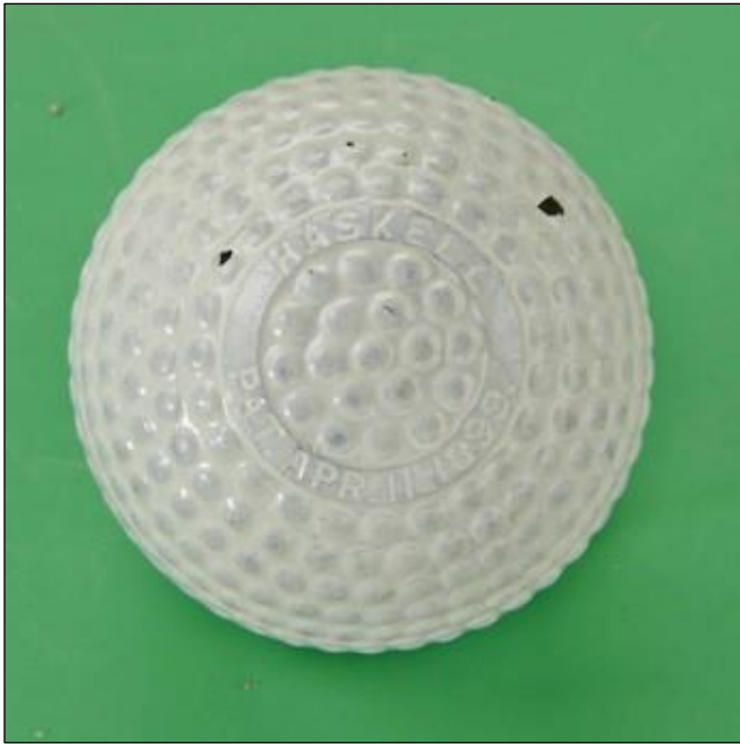
Figure 8 "Haskell" golf ball

different reasons, none of the golf balls which were the making of golf were patented in the UK.