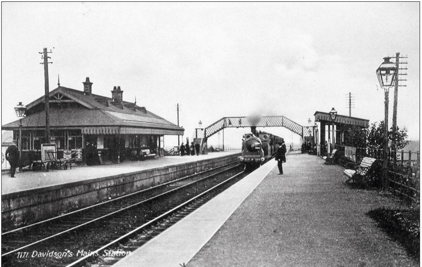
Figure 9 Davidson's Mains Station