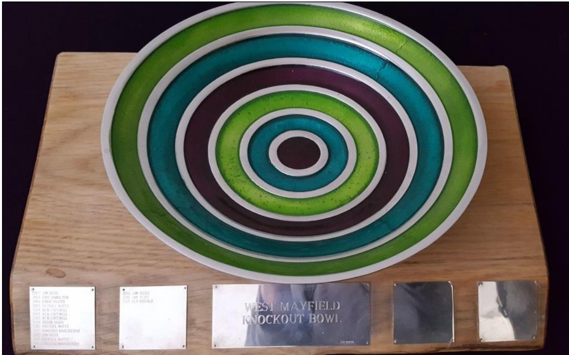
Figure 5 Match Play Trophy