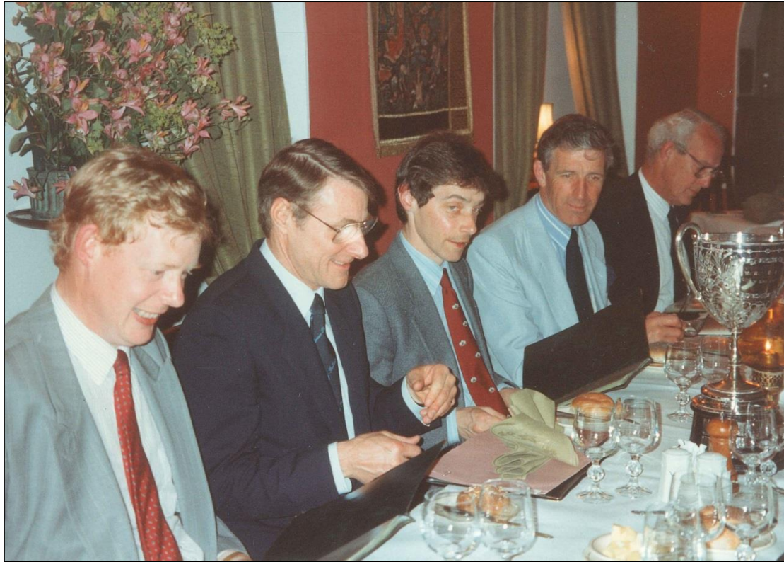
Figure 11 Centenary celebrations, Kinross 19 th June 1993