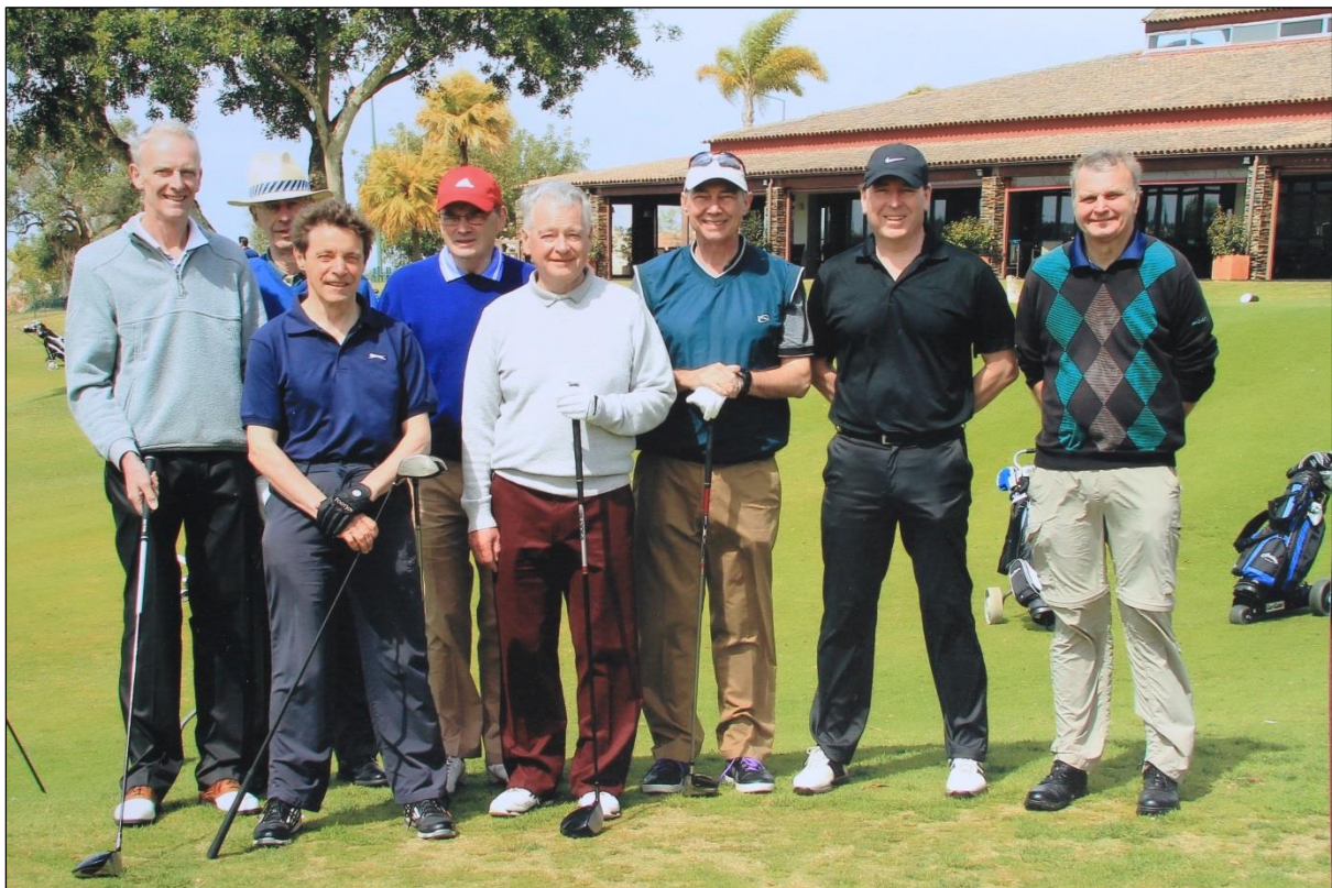
Figure 21 Vale da Pinta, Albufeira, Algarve April 2016